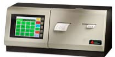
FreshMarx® 9415 automated freshness solution